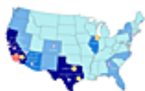
Map 1. State Proportion of the Mexican Born Population in the United States (PDF)

The top 15 metropolitan areas for Mexican immigrants were home to more than 6.6 million Mexican immigrants in 2006 (see Map 1).